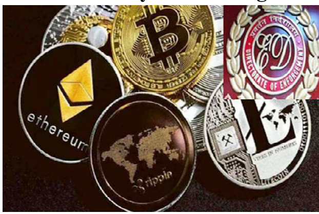
Account balances of nine Chinese-Controlled firms were seized by the Enforcement Directorate.

ED initiated a money laundering investigation based on an FIR dated October 08, 2021. filed under various sections of the Indian Penal Code, 1860. by Cyber Crime Police Station. Kohima, Nagaland, against HPZ token and others. The HPZ Token promised users of large gains against investment by declaring the same as "in-vesting in mining machines for