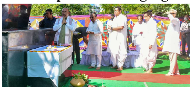
Imphal, Sept 30:

Chief Minister N. Biren Singh led the State in paying rich tributes to Jana Neta Hijam Irawat during the state-level observance of Jana Neta Hijam